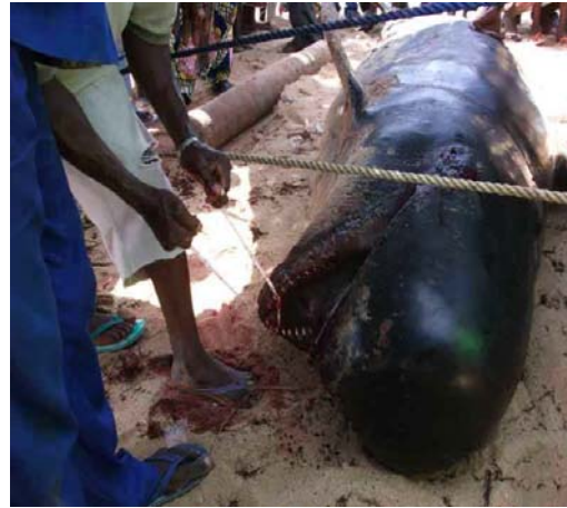
Fig. 3. Short-finned pilot whale, Globicephala macrorhynchus landed at Ekpè in 2011, to be sold as marine bushmeat.

Short-finned pilot whale Globicephala macrorhynchus Gray, 1846. One short-finned pilot whale was landed by artisanal fishermen at Ekpè (06°21.9306' N,