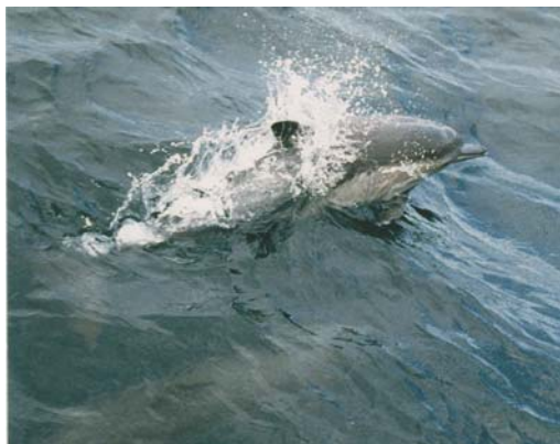
Fig. 4. Common dolphin, Delphinus sp. sighted on 7 October 2002 (Table 1, record #071002-20).