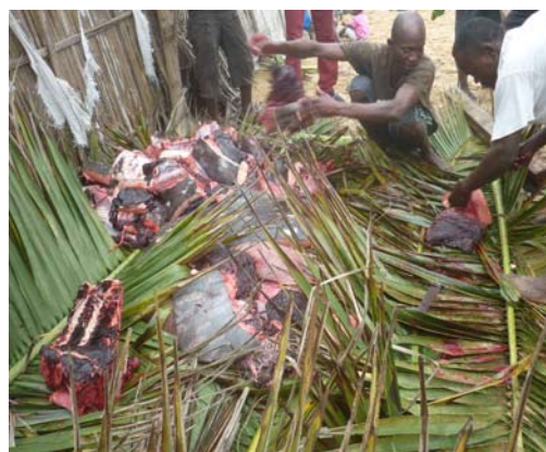
Fig. 6. Marine bushmeat obtained from a Cuvier's beaked whale at Togbin, gathered at one site before equitable distribution among locals.

Cuvier's beaked whale was swiftly exsanguinated, decapitated and sectioned in chunks with machetes and knives. Fishermen and locals shared the meat (Fig. 6). None seemed aware or concerned of the protected status of cetaceans, although the local press raised the issue (Fraternité, 2011).