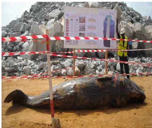
Fig. 7. Neonate/foetus of sperm whale, Physeter macrocephalus found stranded near Cotonou port.

Sperm whale Physeter macrocephalus Linnaeus, 1758. On 19 April 2010 the MNT museum was alerted by the Service Environnement du Port Autonome de Cotonou that a small sperm whale had stranded on a beach within the port's security zone. One of the authors (JDB) and agents of the Direction Générale des Forêts et Ressources Naturelles from Ministère de l'Environnement et de la Protection de la Nature documented the event (Fig. 7). The carcass was buried in situ without biological sampling. Body length was reported as 367