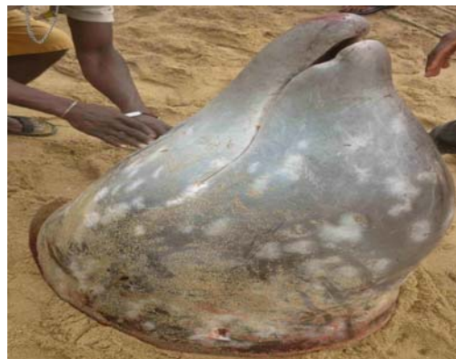
Fig. 5. Severed head of a young male Cuvier's beaked whale, Ziphius cavirostris , at Togbin in 2011 (see text).

Cuvier's beaked whale , Ziphius cavirostris Cuvier, 1823. In the morning (09:00 h) of 14 August 2011, locals of Fidjrossè, Togbin ( 06^{\circ}27.635' , N 002^{\circ}23.492' E), Département du Littoral, witnessed three small whales swimming close to shore. Fishermen returning from nocturnal fishing operations alerted associates onshore and jointly managed to drive one animal into shallow water. By attaching a rope around the tailstock the shore-based crew, aided by onlookers, pulled the ca. 4 m long whale towards the beach (Fig. 5). The male