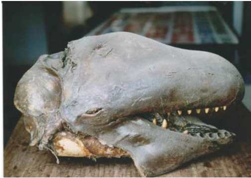
Fig. 2. Mummified head of false killer whale, Pseudorca crassidens , at the Fisheries Directorate in Cotonou.

Pêche, Cotonou, holds the mummified head of an adult false killer whale Pseudorca crassidens (Fig. 2) (Van Waerebeek et al. , 2001a, 2009; Tchiboza & Van Waerebeek, 2007). Tooth counts are UL8, UR8, LL10, LR10. The teeth, circular in cross-section, allow a positive differentiation from the killer whale Orcinus orca , which has oval teeth. Although circumstances were unclear, the conservator confirmed that without exception all collection specimens originated from Benin, therefore, this P. crassidens represents the country's first record. Documented cases in West Africa remain scarce (Jefferson et al. , 1997; Weir, 2010; Perrin & Van Waerebeek, 2012), but records of strandings and captures indicate that P. crassidens is widely distributed in and contiguous to the Gulf of Guinea. Strandings are known from Assini, Côte d'Ivoire (van Bree, 1972), Cap Esterias, Gabon (Van Waerebeek & De Smet, 1996) while three false killer whales were landed at Apam, Ghana (Van Waerebeek et al. , 2009; Debrah et al. , 2010).