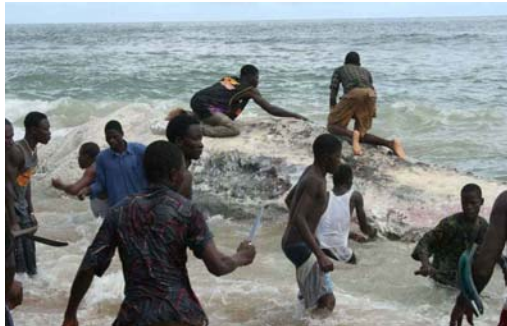
Fig. 8. Humpback whale, Megaptera novaeangliae stranded on Sèmè Kraké beach, in 2009, causes a frenzy among local youths despite the carcass' advanced state of decomposition.

Three boat-based surveys to evaluate the feasibility of whale-watching tourism in Benin, in October 2000, September 2001 and October 2002, recorded, respectively, 40, 26 and 42 humpback whales (Sohou et al. , 2001; Van Waerebeek et al. , 2000, 2001a,b; Van Waerebeek, 2007; Tchibozo & Van Waerebeek, 2007). This species is seasonally present off Benin and Togo from early August till mid-November (occasionally early December), indicating a wintering ground of a Southern Hemisphere population, earlier referred to as the Bight of Benin substock (Van Waerebeek, 2003; Van Waerebeek et al. , 2001a,b).