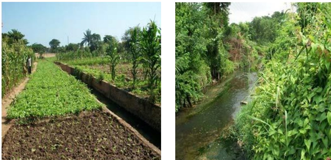
Fig. 3. A drain and a river used for irrigating vegetables on a farming site in Accra

Soil sampling. Soil samples were also collected monthly from 12 randomly selected vegetable beds (one each from 12 different farmers) at a depth of 0–20 cm over the sampling period of 3 months from all study sites. A total of 144 soil samples were collected for analysis. Sampling was done with a plastic spate and packaged into transparent zipped lock plastic bags and transported to the laboratory in bigger plastic bags.