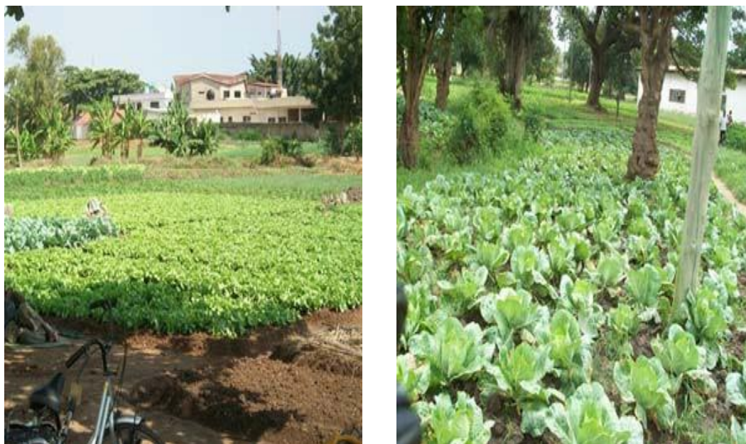
Fig. 2. Vegetable beds with and without crops on some of the farming sites in Accra

(Mampong), there was a municipal (domestic) waste dumping site in close proximity. The soil texture on study sites varied largely between clay and sand extremes.